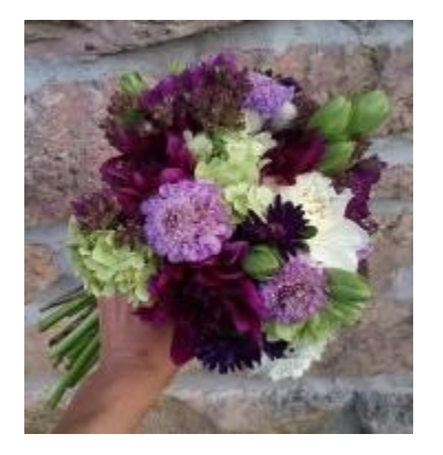
Dahlias, Hydrangeas, Scabiosa, Aster, Hosta Flowers