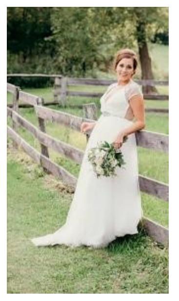
Dahlias, Succulents, Veronica, Greens

Yarrow, Ageratum, Sedum, Queen Anne's Lace, Blue Vervain, Zinnias, Amaranth, Oregano Flower, Phlox, Goldenrod, Globe Amaranth, Aster Greens