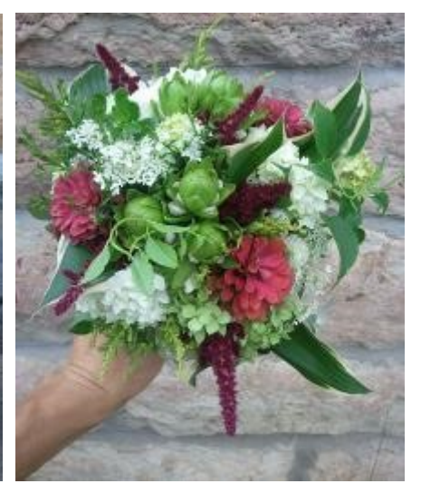
Zinnia, Queen Anne's Lace, Amaranth, Hydrangea, Goldenrod, Hosta Flower