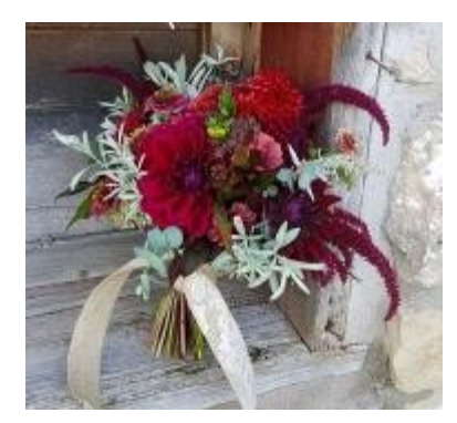
Zinnia, Amaranth, Dahlia, Eucalyptus, Obedient Plant, Artemisia