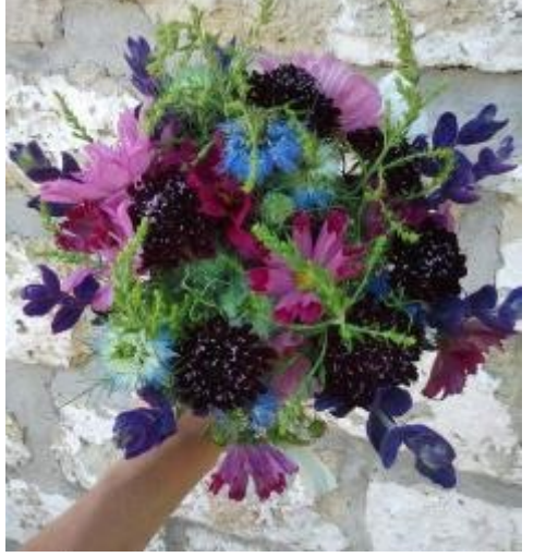
Scabiosa, Cosmos, Salvia, Goldenrod, Nigella