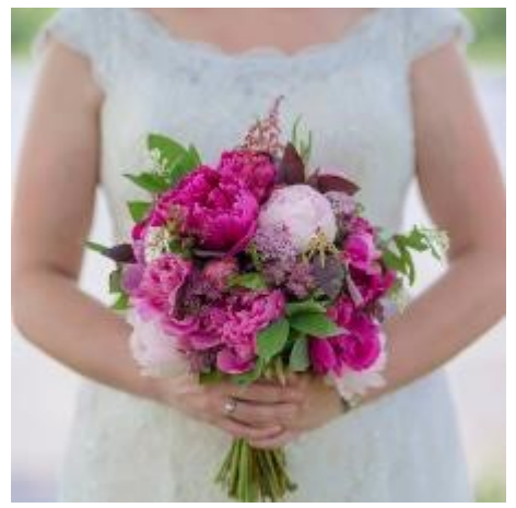
Peony, Astilbe, Veronica, Goat's Beard, Spirea