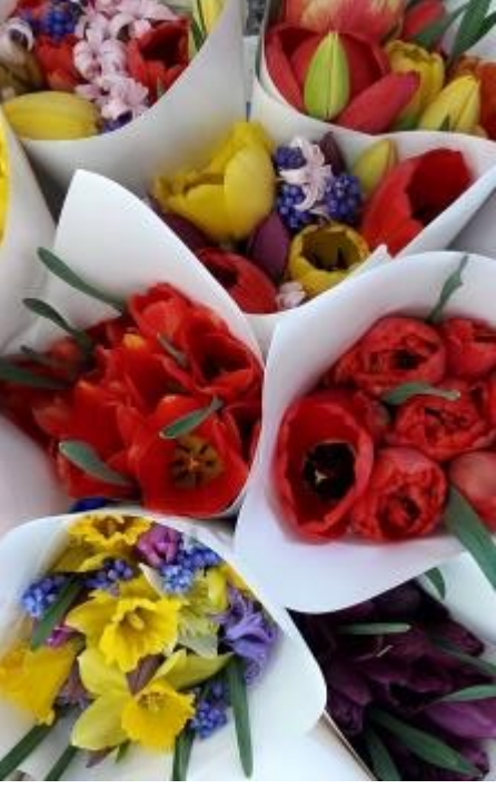
Tulips, Hyacinth, Muscari (Grape Hyacinth), Daffodils