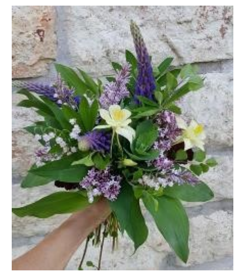
Lupine, Korean Lilac, Columbine, Lily of the Valley, Sedum