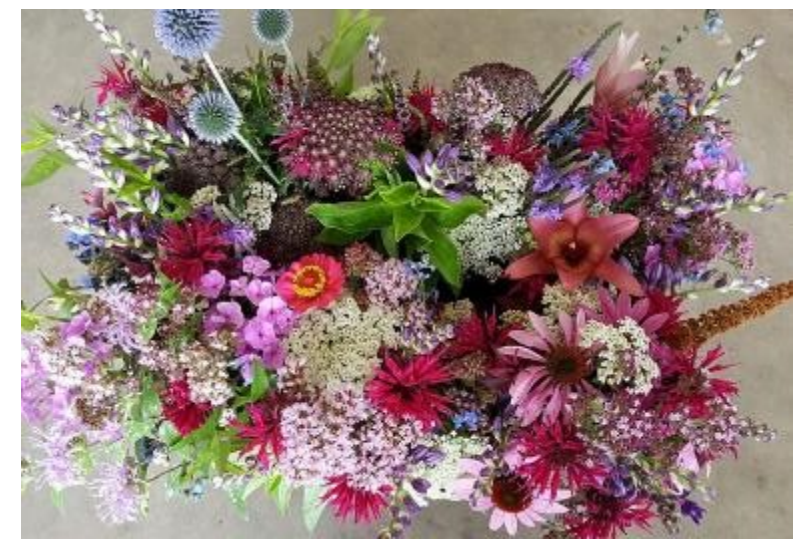
Lilies, Echinacia, Queen Anne's Lace, Monarda, Dara, Yarrow, Phlox, Hosta Flowers, Blue Vervain, Amaranth, Globe Thistle, Oregano Flower

Late July: Lilies, Black Eyed Susan, Stargazer Lilies, Snapdragons, Sunflowers, Echinacea, Scabosia, Hydrangea, Zinnia, Bee Balm, Yarrow, Queen Anne's Lace, Hosta