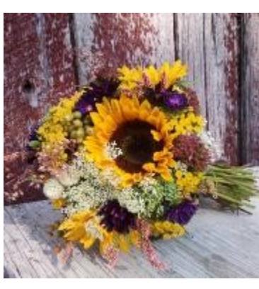
Sunflowers, Aster, Queen Anne's Lace, Oregano Flower, Tansy