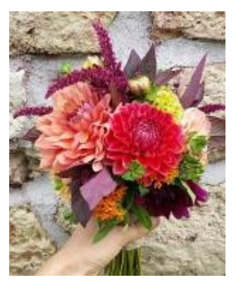
Dahlia, Amaranth, Celosia, Butterfly Weed