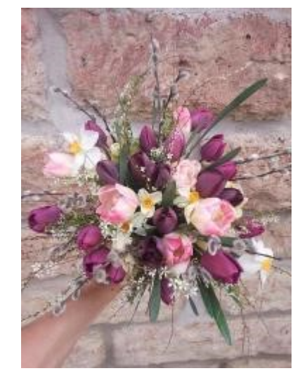
Tulips, Daffodils, Pussy Willow, Flowering Branches, Greenery