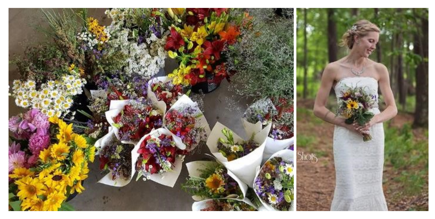
Peonies, Sunflowers, Dasies, Grasses, Lilies, Baby's Breath, Yarrow

Late June: Sunflowers, Lupine, Grasses, Iris, Yellow field flowers, Daisy, Hosta leaves – filler, Peony, Lilies, Ferns, Yarrow, Baby's breath, Astilbe