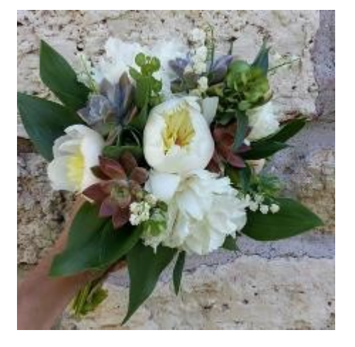
Peony, Succulents, Lily of the Valley, Shepard's Purse