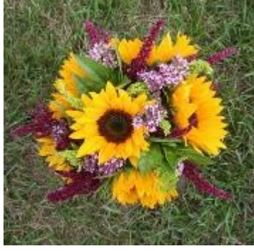
Sunflowers, Amaranth, Goldenrod, Flowering Oregano, Basil