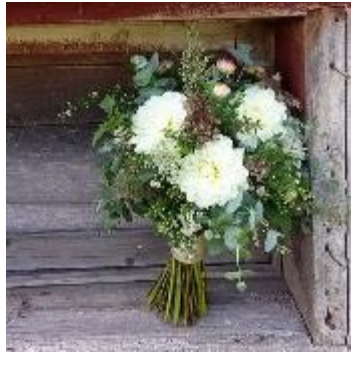
Dahlias, Strawflowers, Eucalyptus, Asters, Dara, Queen Anne's Lace, Herbs