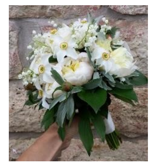
Peony, Lily of the Valley, Daffodils, Greenery