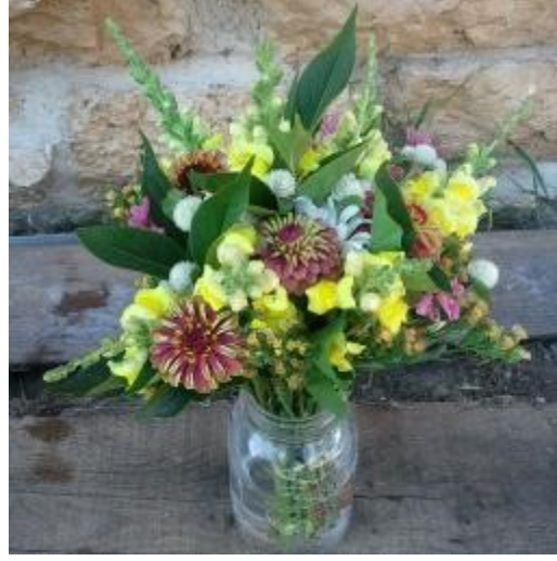
Zinnia, Snapdragon, Statice, Globe Amaranth