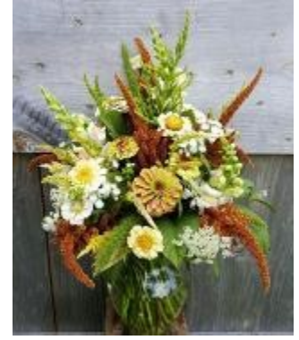
Zinnia, Amaranth, Ageratum, Queen Anne's Lace, Snap Dragon