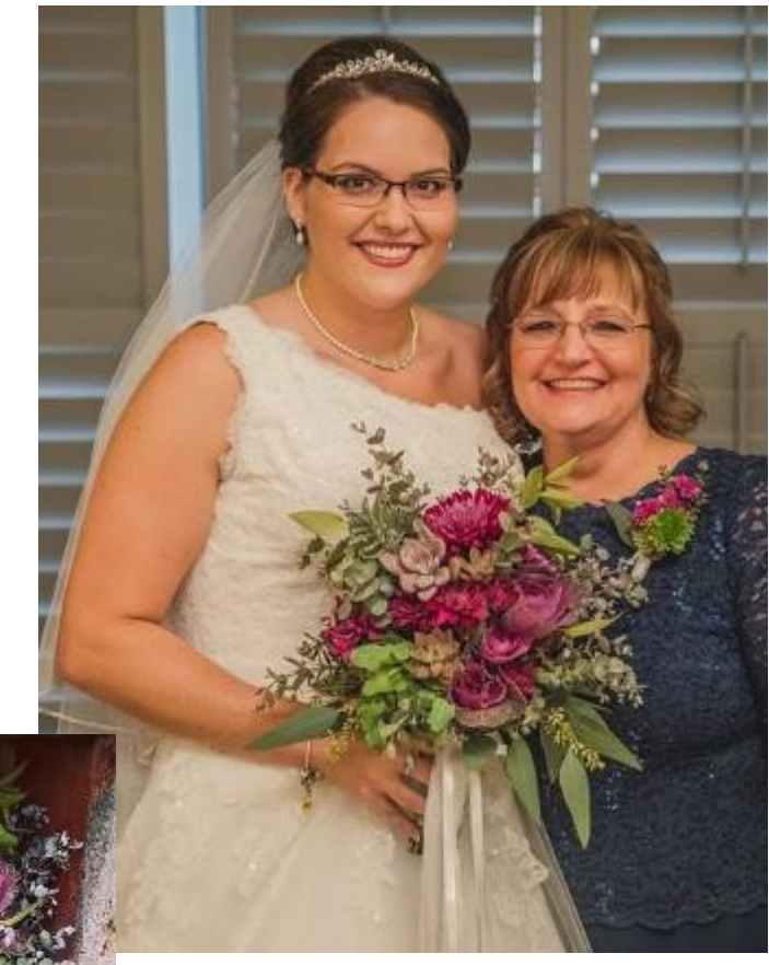
Flowering Kale, Succulents, Eucalyptus, Lavender, Chrysanthemums, Cerinthe