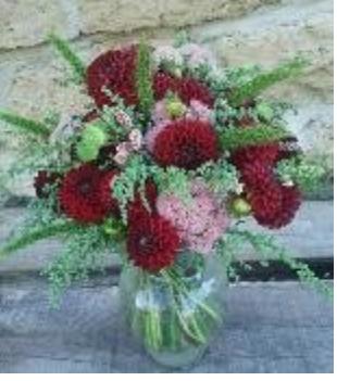
Dahlias, Sedum, Fox Tail, Wild Grasses