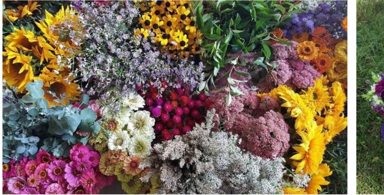
Sunflowers, Wild Aster, Black Eyed Susan, Ageratum, Zinnia, Sedum, Eucalyptus, Globe Amaranth, White Chives, Wild Sage

Late September: Sunflowers, Sedum, Zinnias, Obedient plant - light purple, Celosia, Amaranth burgundy, Gladiolas, Grasses, Statice, Scabiosa, Tansy, Flowering Oregano, Snapdragons, Black eyed Susan, Wild Aster