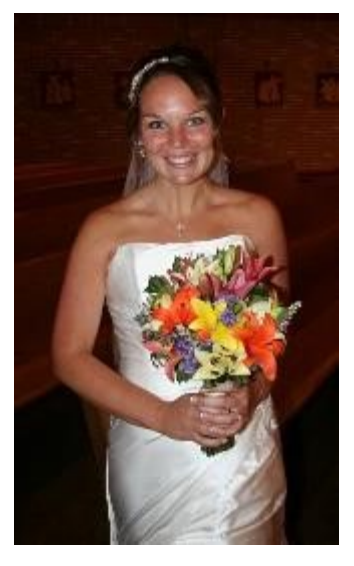
Sunflowers, Zinnia, Lilies, Phlox, Oregano Flowers, Grasses, Black